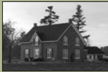
B. MABEE HOUSE 1861 An example of a Gothic Revival farmhouse constructed of brick that was manufactured in the local brickyard, located on the flats of Young's Creek.