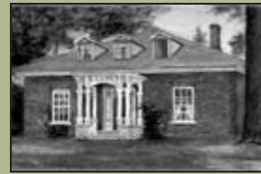
E. McCALL HOUSE circa 1850 This is an excellent example of an Ontario Cottage, located just west of the village.