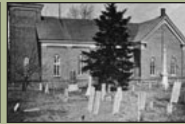
F. WOODHOUSE UNITED CHURCH 1860 This was a Methodist Church site dating back to 1800. The union of the Presbyterians, the Congregationalists and the Methodists gave birth to the United Church of Canada in 1925.