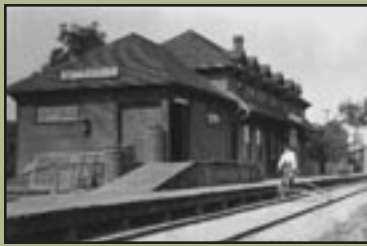
A. VITTORIA TRAIN STATION 1888 Torn down in the early 1940s, the station was located near the Vittoria & District Community Centre. Originally the South Norfolk Railway, it became part of the Grand Trunk Railway System. Tracks were removed in 1965.