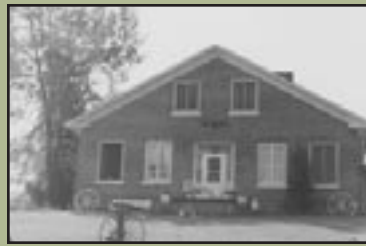
D. MILL HOUSE circa 1850 The miller's house overlooks the mill pond, where one of the first grist mills in the Long Point area was built.